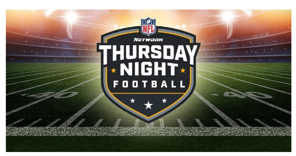
JOIN US THURSDAY NIGHTS AND FOR SUNDAY FUNDAY!